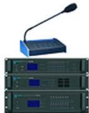
Public Address System (PA)