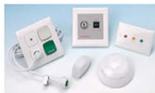
Nurse Call Systems