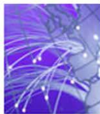
IT & TELECOMMUNICATIONS