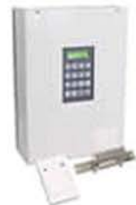
Security & Monitoring